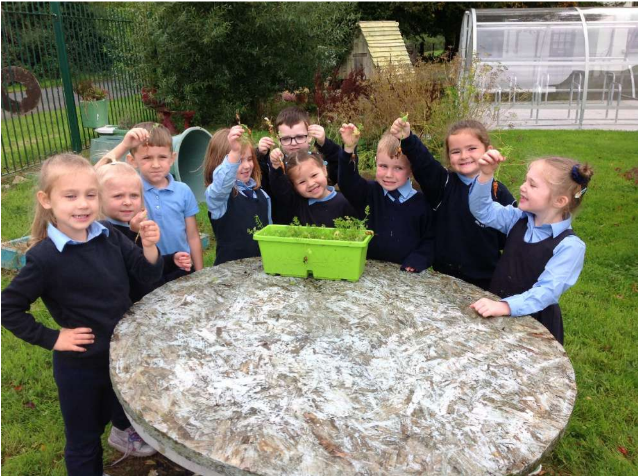
Harvesting the carrots