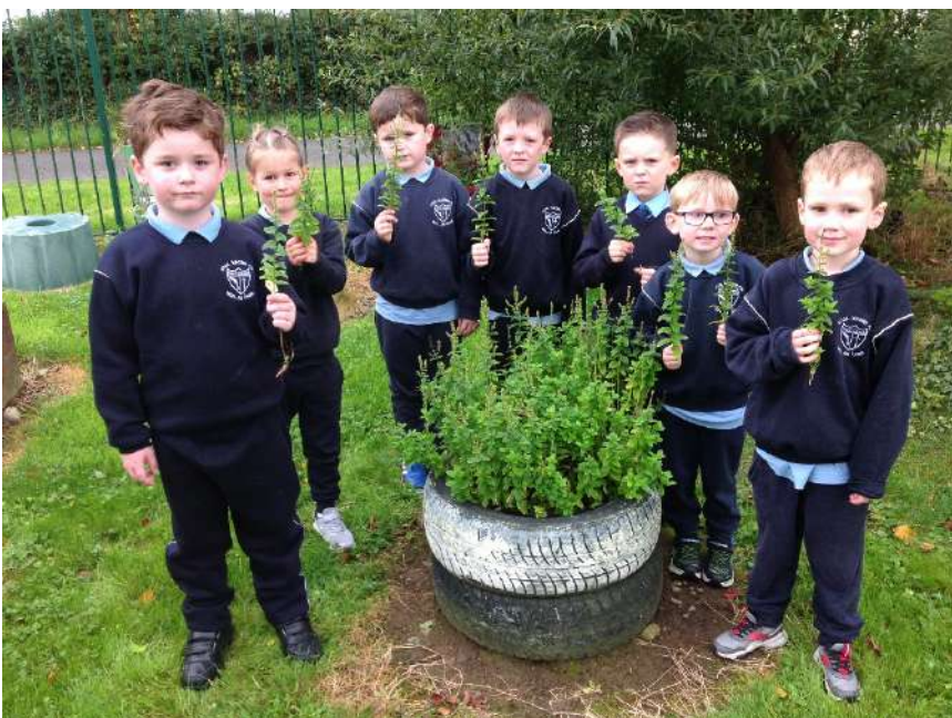
Harvesting the Herbs